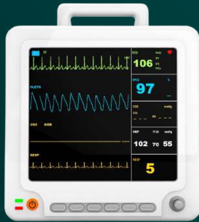
CARDIAC DIAGNOSTICS EQUIPMENTS