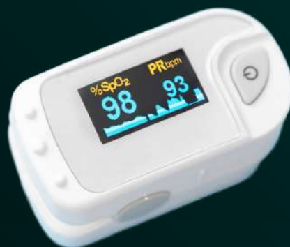
PATIENT MONITORING EQUIPMENTS