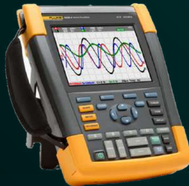
BIO MEDICAL TEST EQUIPMENTS